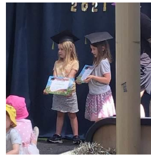
“Rock-a-Bye Bear – Shh, Shh, Shh.”