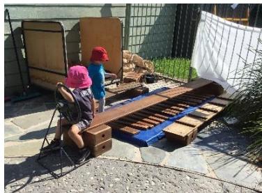
b. Block Play Environment